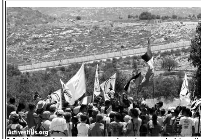
Weekly nonviolent protest against the apartheid wall in the village of Bil'in, where 60% of the Palestinian land has been confiscated for Israeli settlement expansion.

The pillars of Israeli apartheid are the The Law of Return (1950) and The Citizenship Law (1952), which allow Jews to freely immigrate to Israel and gain citizenship, but simultaneously deny Palestinians refugees that same right as guaranteed by United Nations Resolution 194. According to Azmi Bishara, exiled Palestinian-Israeli politician and scholar, this constitutes a meta-form of apartheid wherein the forcible separation upheld by decree is that which prohibits the return of Palestinians to their lands. Today, nearly 5.5 million Palestinians