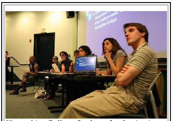
Hampshire College Students for Justice in Palestine present their research at an informational meeting on divestment.

In July of 2005, the divestment movement received the support, endorsement, and urging of the moral authority on Palestine and Palestinian rights. A coalition of over 170 Palestinian civic society organizations