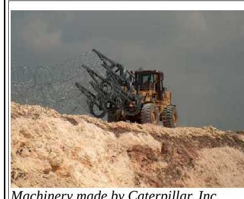
Machinery made by Caterpillar, Inc. lays razor wire along the route of Israel's apartheid wall.

When using the databases listed below, there are a few things to keep in mind: