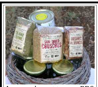
As a supplement to your BDS work, consider selling Palestinian products in your community or getting involved with micro-credit programs with communities in need.